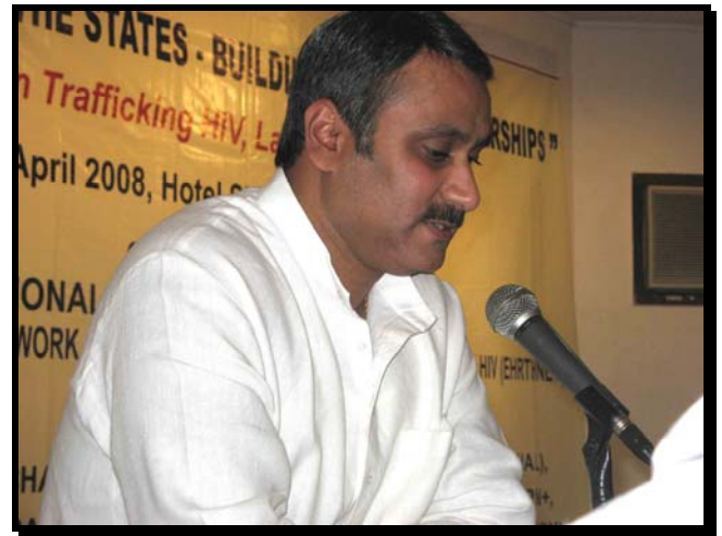
(Dr. Ambumani Ramadoss, Union Minister of Health and Family Welfare )

Dr. Ambumani Ramadoss, Union Minister of Health and Family Welfare congratulated NCAT for bringing the centre to the people and for forming a bridge between the two, through the state governments. All issues are linked, he said. He conveyed regards, good wishes and regrets from Minister of State for Commerce, Mr. Jairam Ramesh, stating that Mr Ramesh had to cancel his trip to North Bengal as he had been given extra charges of the Ministry of Power, just the previous day, in addition to his own portfolio. He informed that the Govt. is doing a lot on HIV - NACP III now, with NACP I in 1990. Rs. 2500 – Rs. 3000 crores over the years. Almost 20% of people in India still don't know about HIV. Youth, which is the high risk group in the country, almost 600,000, need to be protected against risks posed by HIV/AIDS, tobacco, junk food etc