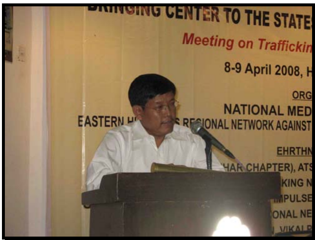
Mr Nakul Das Rai, MP, Sikkim

Mr Nakul Das Rai, MP, Sikkim informed that tea gardens have multiple problems, which the Government has to solve. These include a lack of proper wages & opportunities. A Policy on HIV and trafficking needs to take ground realities into consideration and Govt. needs to formulate special policies. Govt. Doctors, NGOs, teachers need to work closely together. He would support these issues.