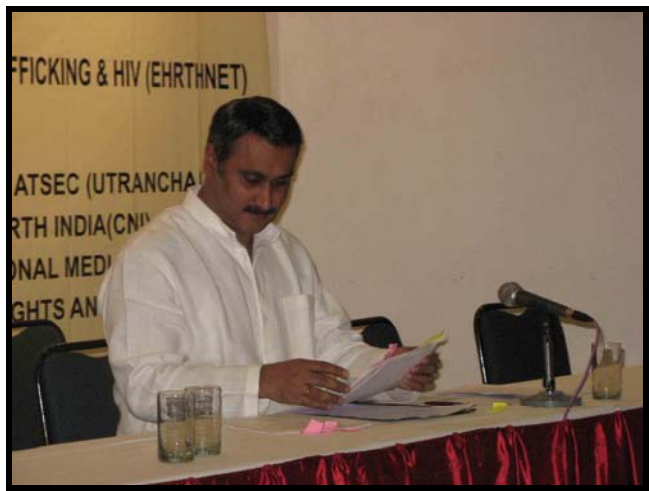
(Dr Ambumani Ramadoss , Union Health Minister)

Ambumani Ramadoss for giving us hope that things are going to change.