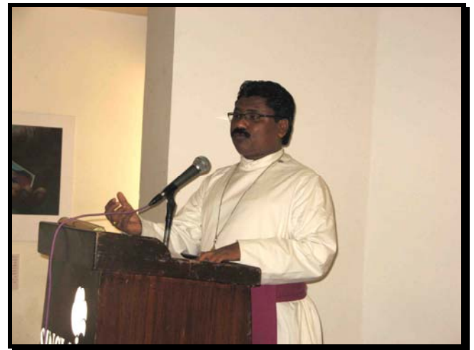
(Rev Naresh Ambala Bishop Eastern Himalayas)

Finally he emphasized that Unemployment, Labour problems, Malnutrition , Trafficking , Gender Based Violence , were negation of Human Values and it was the duty of the state to come to the rescue of the suffering masses.