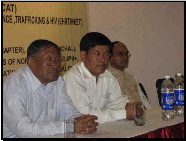
(Honourable MPs from the Eastern Himalaya Region)

related to trafficking in human beings for various purposes.