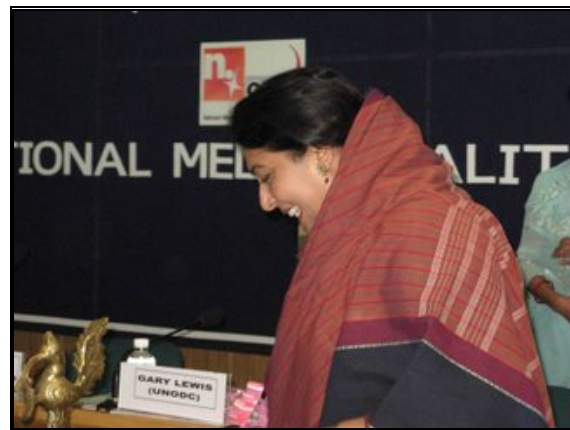
(Honourable Minister Ms Renuka Choudhury at the Inaugural Session)